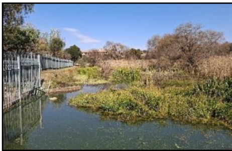
The dam before it was drained.

We did some ground work in the dam area behind the reed bed to create a safe island for ducks to breed on. However, water goes where water wants to so we'll have to wait for the next rain to see if everything works out.