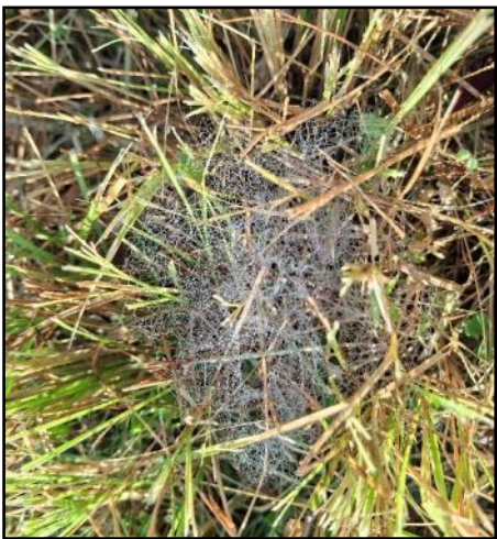
Tangle web spider’s web