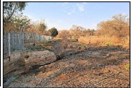
...and finally empty!

Lovely as it was to have the dam full, it also brought some new problems that had to be addressed.