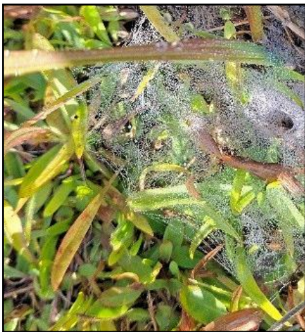
Grass funnel web spider’s web