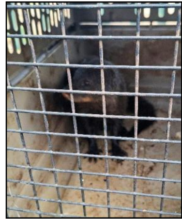
Our new water mongoose