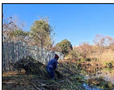
Greece carting away plants