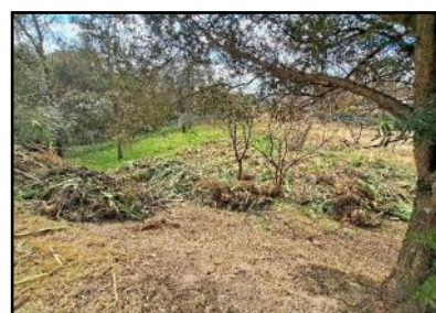
Some of the alien plants that were removed